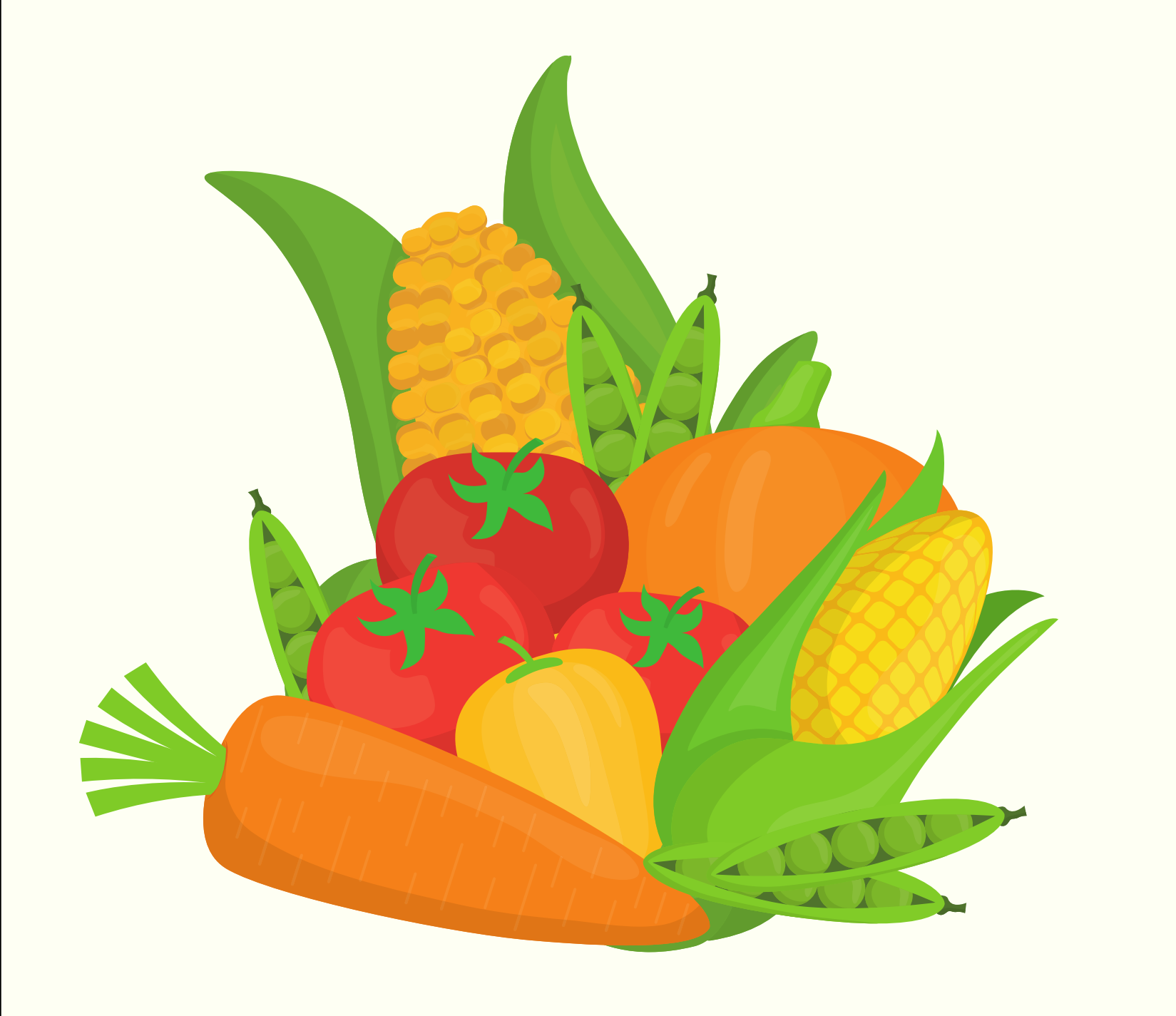
VECCIE 1/3 LB QUINOA AND BROWN RICE WITH ROASTED CORN 11.95