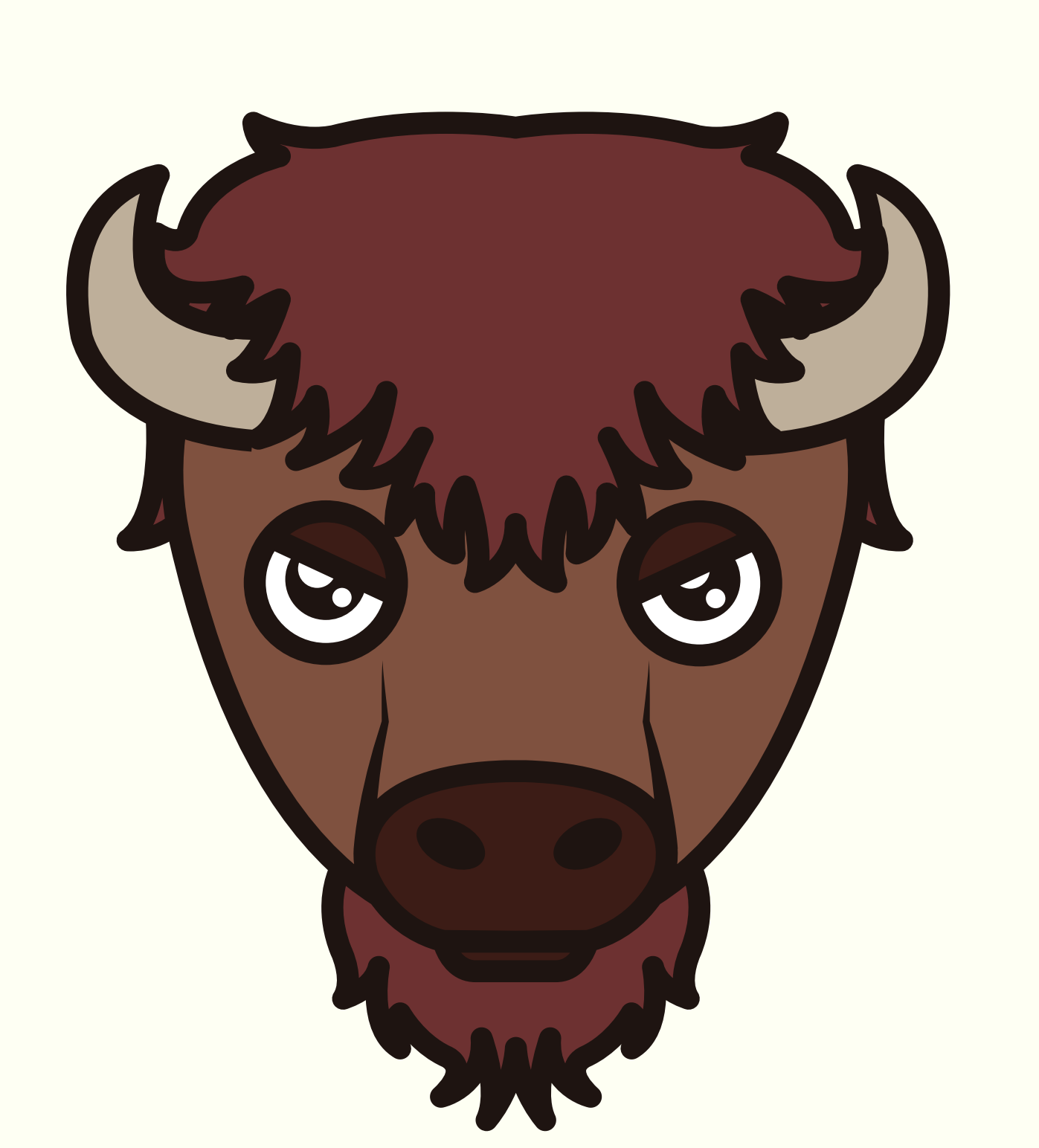
BISON 1/3 LB HAND PRESSED GROUND BISON PATTY 15.95