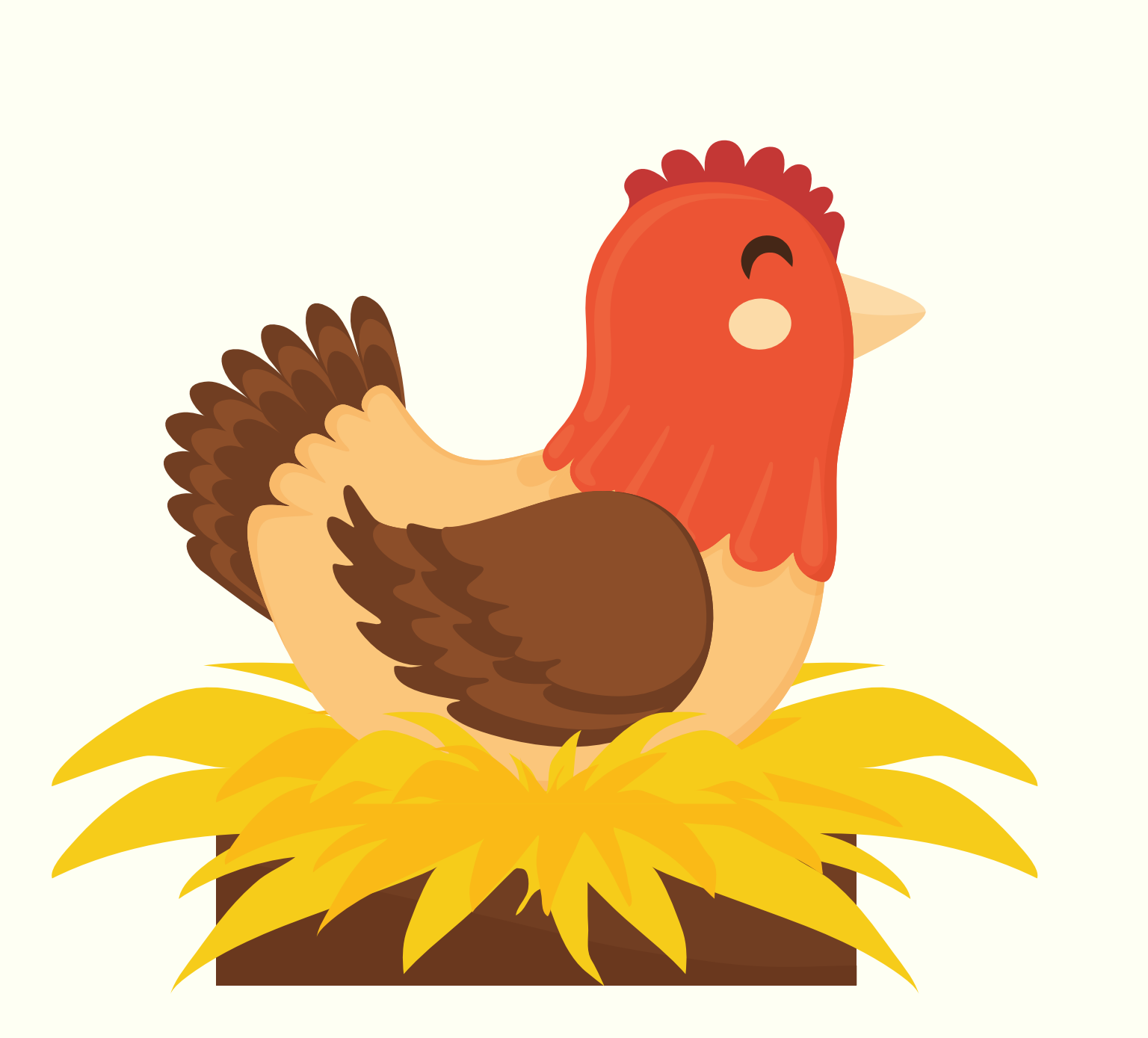
CHICKEN 60Z ALL WHITE MEAT GRILLED CHICKEN BREAST 12.95